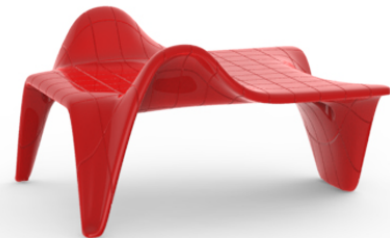
Side Table 29-1/2" x 35-1/2" x 20"