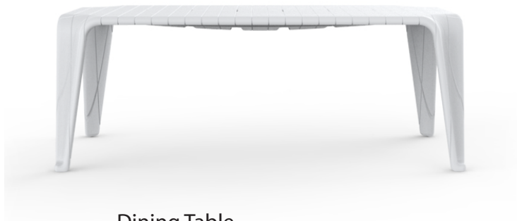
Dining Table 74-3/4" x 35-1/2" x 28-1/4"