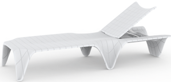
Sun Chaise 82-3/4" x 29-1/2" x 13-1/2"