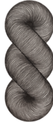
BLACK & WHITE