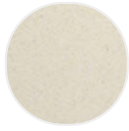
Ceramic gloss white X004