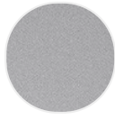
Matt painted aluminium X059