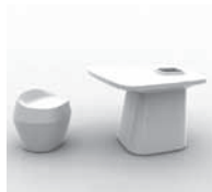
Table 39¼" x 35½" x 28¼" 100x90x72 cm