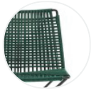
Glossy English green col. 17