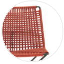
Glossy orange col. 11