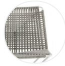
Glossy silver gray col. 04