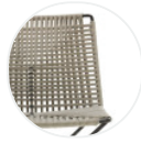
Matt ecru col. 23