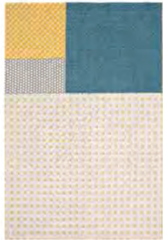
6'8"x9'10" / 200x300 cm Blue.