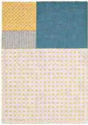
5'7"x7'11" / 170x240 cm Blue.