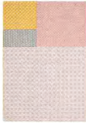
5'7"x7'11" / 170x240 cm Rose.