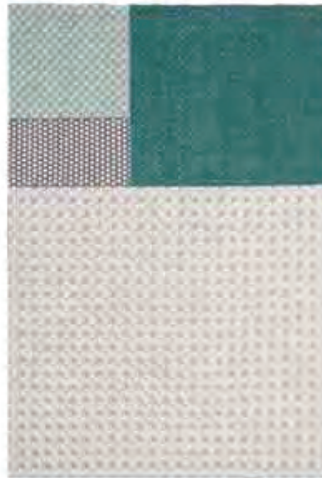
6'8"x9'10" / 200x300 cm Green.