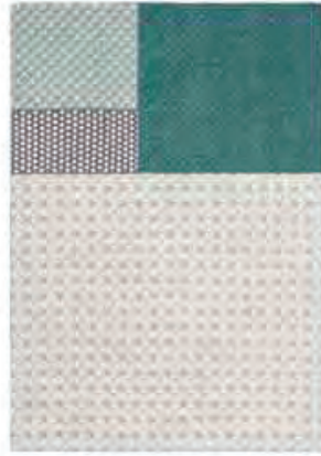
5'7"x7'11" / 170x240 cm Green.