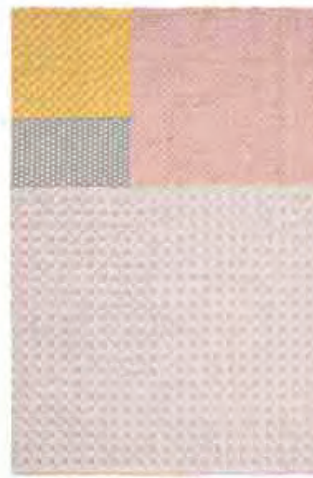
6'8"x9'10" / 200x300 cm Rose.