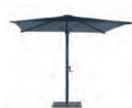
Frame: Anthracite Fabric: Anthracite