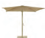
Frame: Sand Fabric: Sand