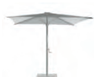
Frame: Silver Fabric: Aluminum