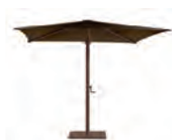
Frame: Bronze Fabric: Bronze