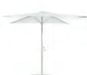
Frame: White Fabric: White