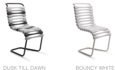
DUSK TILL DAWN