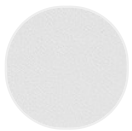
Matt painted white X053