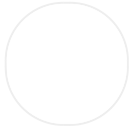
Cristalplant white X038