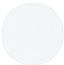
Gloss painted white X060